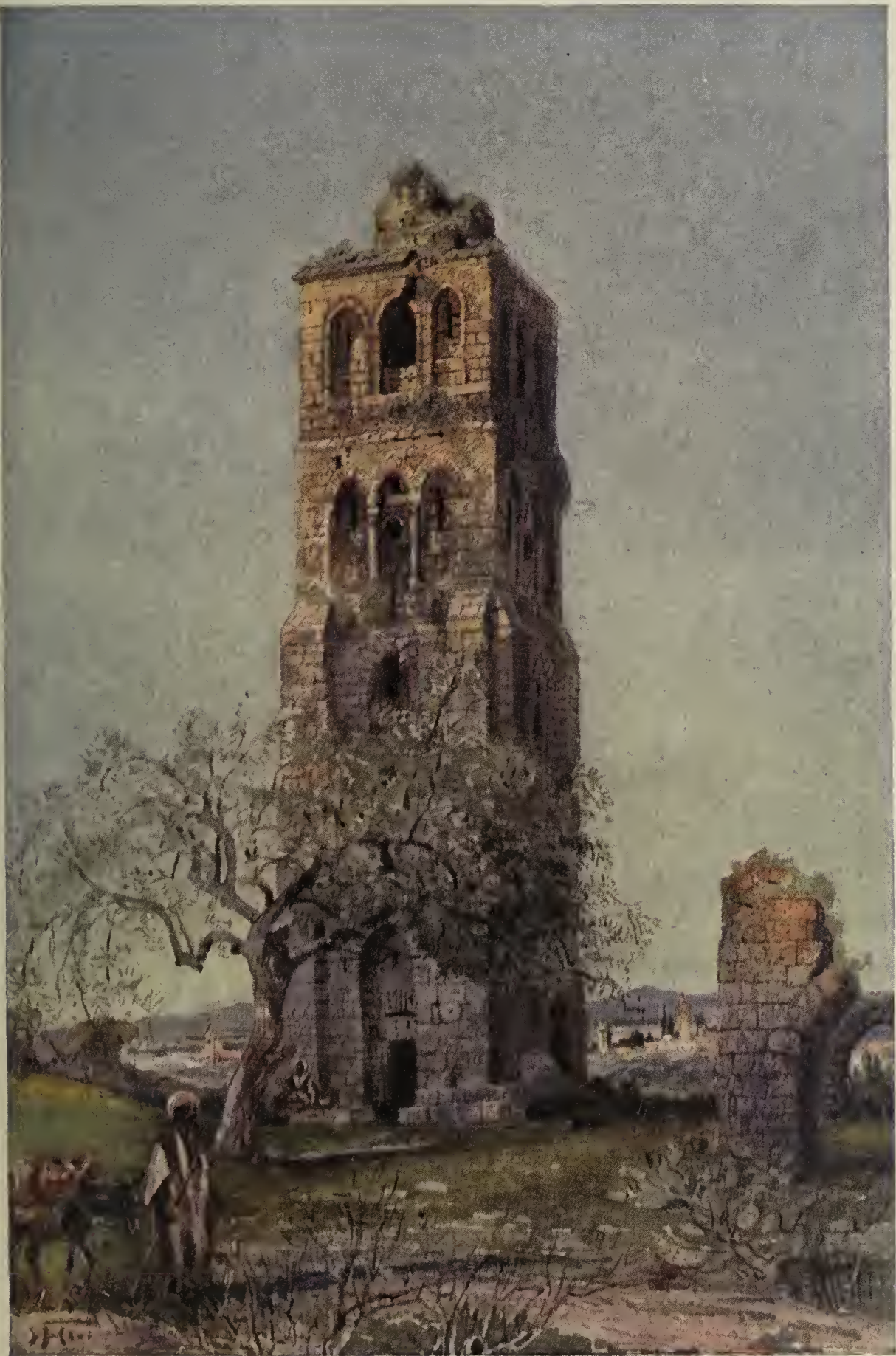
The Tall Tower of the Forty Martyrs at Ramleh.